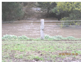
Horse property backing onto Sunday Creek in Broadford on 12-Aug

politan Melbourne, whilst it has been consistent for 6-8wks now, we didn't really experience nearly the worst of the past weekends weather. With over 200mm in some areas, rivers banks broke, towns and homes